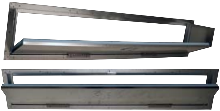
Insulated Sidewall Inlet with Air Deflector

Our inlet doors and vent doors can be used with all the poultry facility evaporative cooling systems we offer, to bring fresh air into your building.