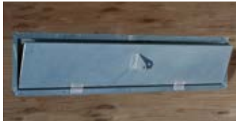
Small Galvanized Inlet

Fold out flap for winch connection. Equipped with door lock latches to keep doors closed.