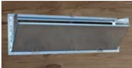
Large Galvanized Inlet with Side Flaps

Sidewall doors with side deflectors to help direct air toward ceiling.