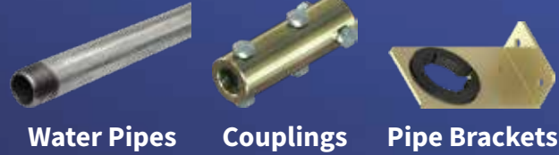
Water Pipes Couplings Pipe Brackets