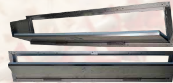
Insulated Sidewall Inlet with Air Deflector